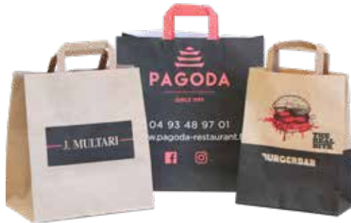
Client: J. Multari, Pagoda, Burgerbar

Paper bags are very popular among environmentally responsible companies, but they are also an effective tool of advertising.