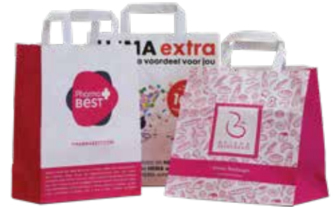
Client: Pharmabest, Hema, Maison Braquehais

Produced on state-of-the-art packaging machines, our bags can be unprinted or printed in up to six colors, so clients can get a high-quality, creative, practical and environmentally-oriented solution for packaging and promotion of their products.