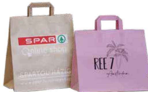
Client: SPAR, Ree 7 Restaurant