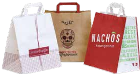
Client: L'atelier Papilles, Ancho Mexican Grill, Nachos