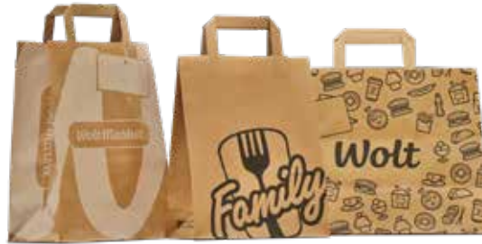
Client: Wolt, Wolt Market

Paper bags are very popular among environmentally responsible companies, but they are also an effective tool of advertising.