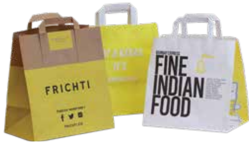
Client: Frichti, Bombay Express